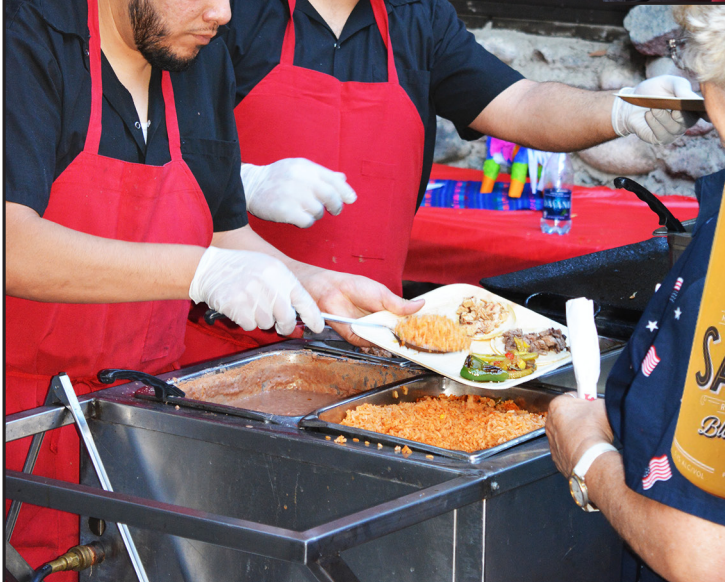
Los Gringos serving up fresh Mexican fare.