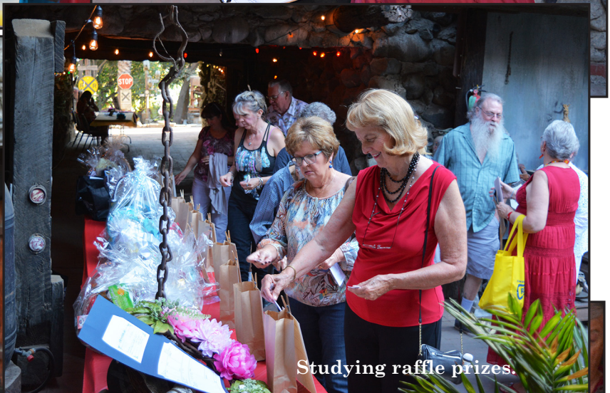
Studying raffle prizes.