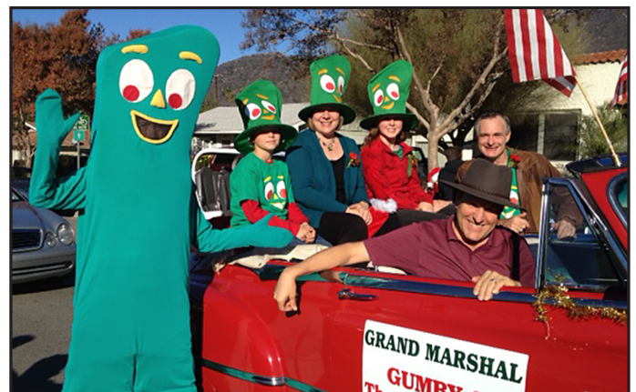
▲ From last year's Christmas parade. Gumby (a Glendora native) turned 60 and looks great.