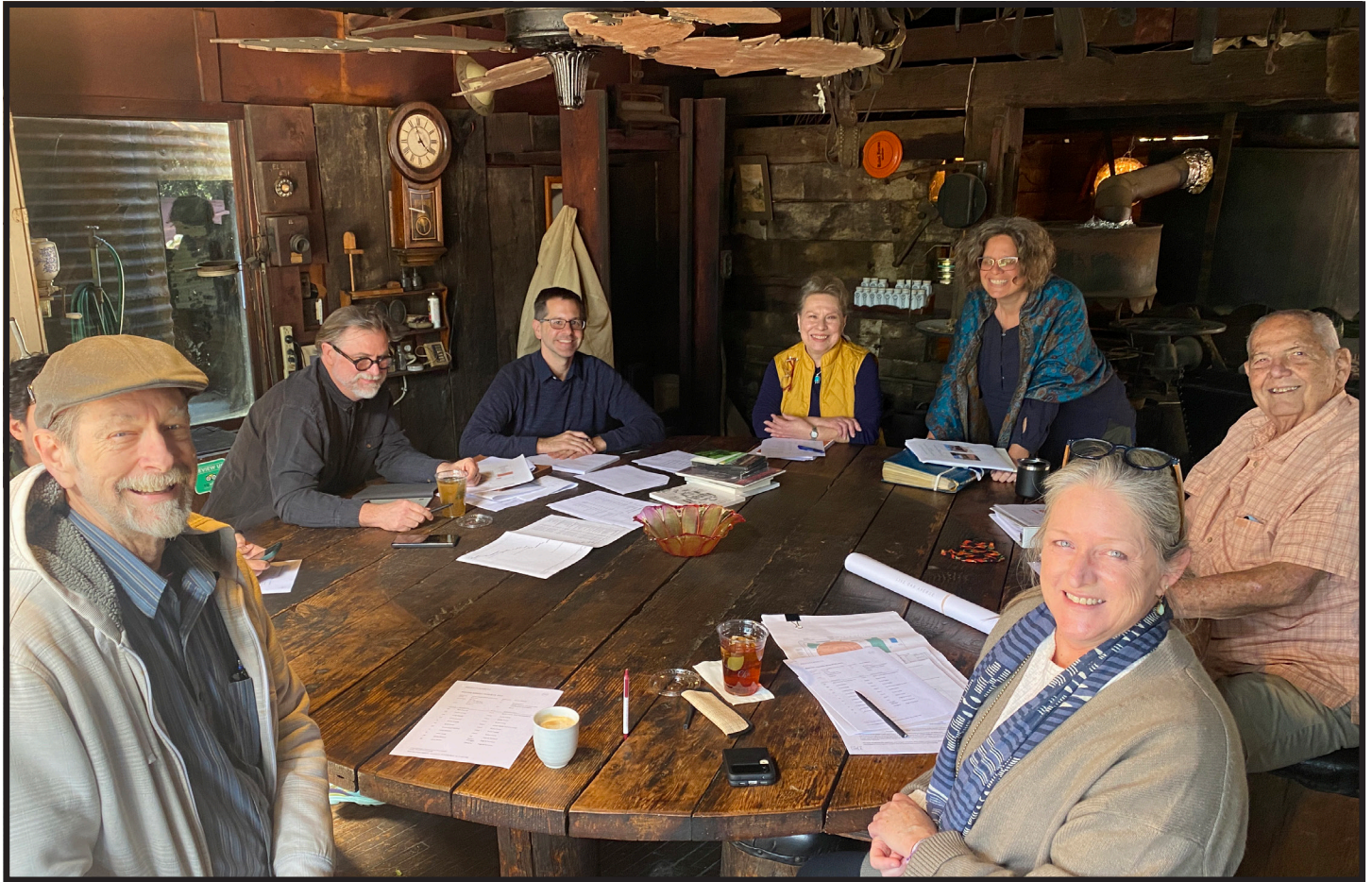
Contract Committee Tour Day. March 11, 2022.