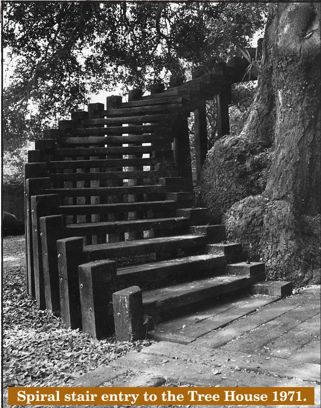
Spiral stair entry to the Tree House 1971.